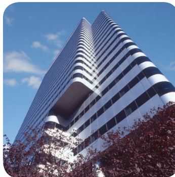
PACWEST CENTER PORTLAND, OR – 522,000 SQ. FT.