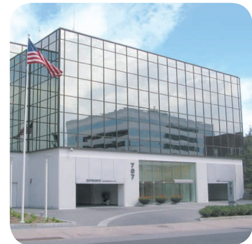
707 SUMMER STREET STAMFORD, CT – 74,000 SQ. FT.