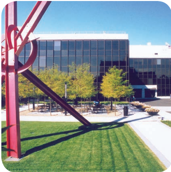
GREENWICH PLAZA GREENWICH, CT – 354,000 SQ. FT.

The experienced, full-time, on-site property management team includes a dedicated vice president/property manager and a property operations administrator. They are supported by full-time engineers, security officers and porters. This team is responsible for operating and maintaining the building and responding to clients' needs. Ashforth's unique client services program includes quality building services, regular communications with clients, client appreciation events and community-based activities all designed to provide a productive environment and create a sense of community at Greenwich Plaza.