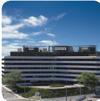
3001 STAMFORD SQUARE STAMFORD, CT – 290,000 SQ. FT.